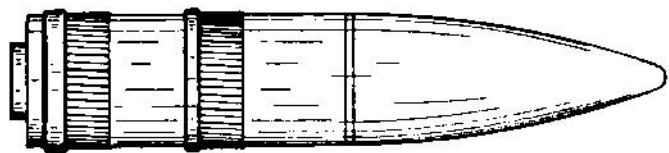
DESIGN OF THE GERMAN LONG-RANGE PROJECTILE.